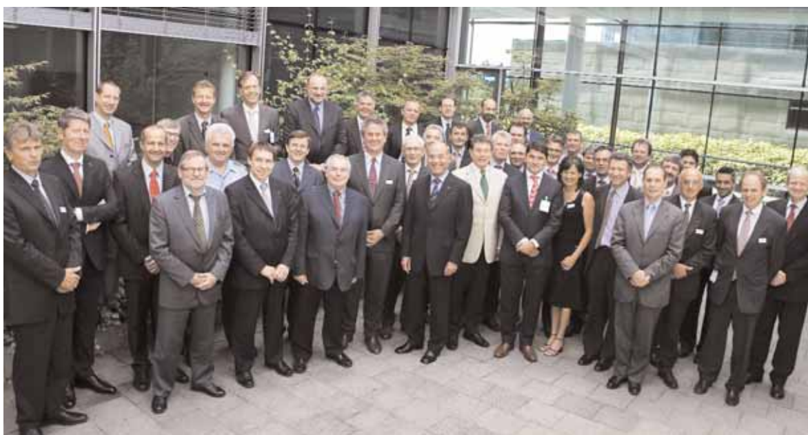
The High-Level Policy Group: Representatives from the States, the Military and from the ANSPs.

These decisions were made in light of the promising results of the Feasibility Study Reports, which identified the high potential available. Provided some specific issues are taken on board in the development phase, the experts indicate that the same high level of safety can be maintained despite the increase in the number of flights. In regard to capacity, sufficient capacity can be made available to accommodate increased traffic demand in a punctual manner. Without FABEC, flight efficiency in the area is expected to deteriorate over the next years. The FABEC initiatives would contribute significantly to counte-